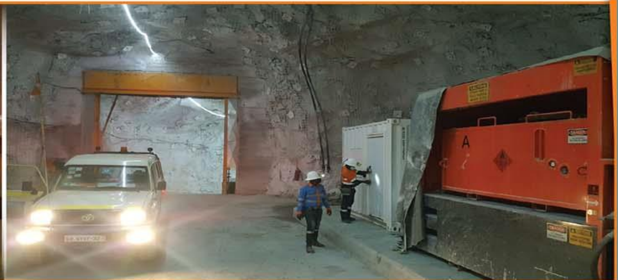
UNDERGROUND FUEL AND SERVICE BAY PIPE LINE CONSTRUCTION