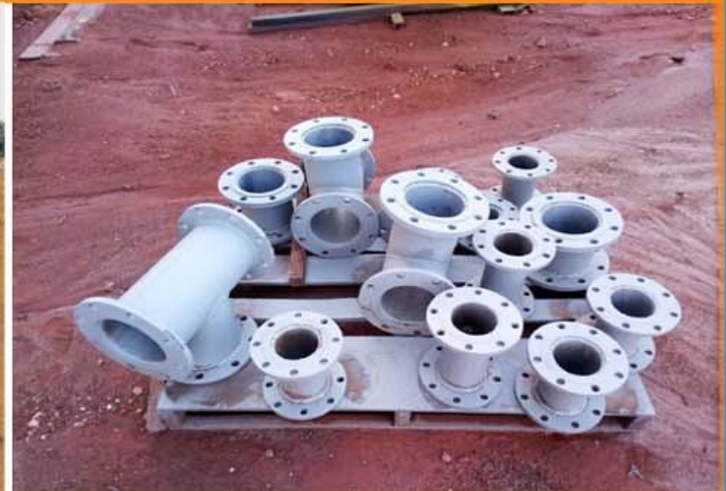
FABRICATION AND INSTALLATION OF STALKER TANKS