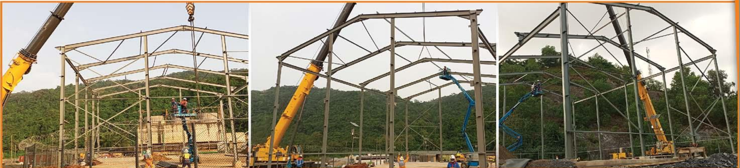
PASTEFIL STRUCTURE STEEL TAB (CONT'D)