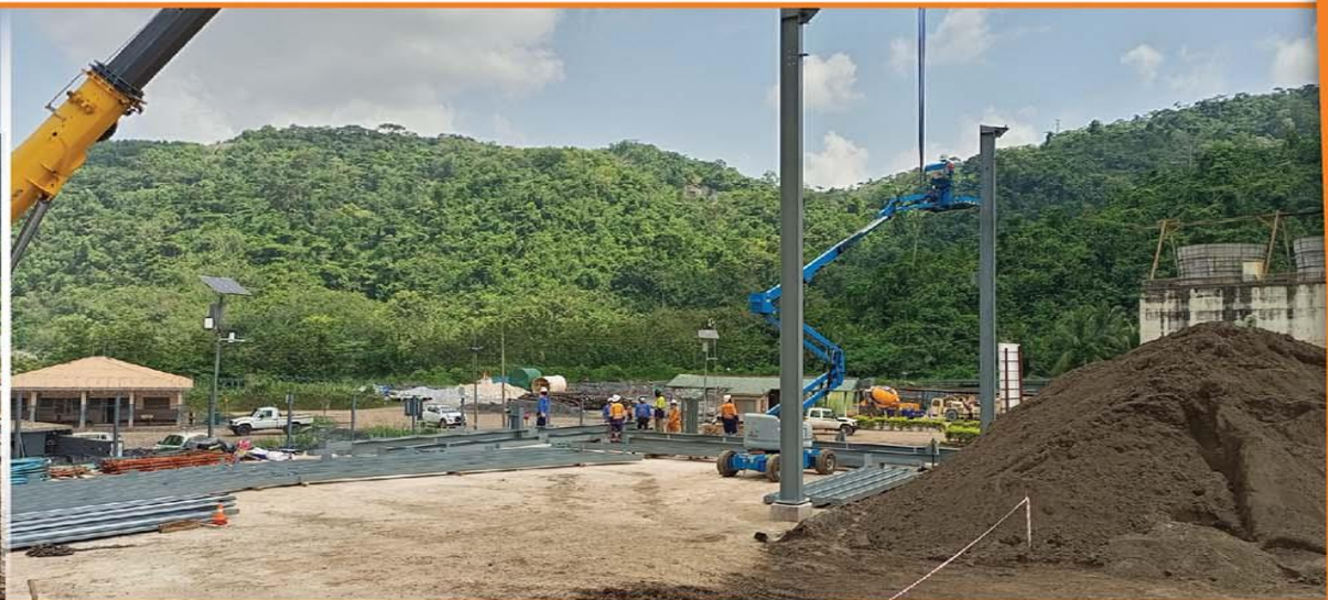
PASTEFIL STRUCTURE STEEL TAB