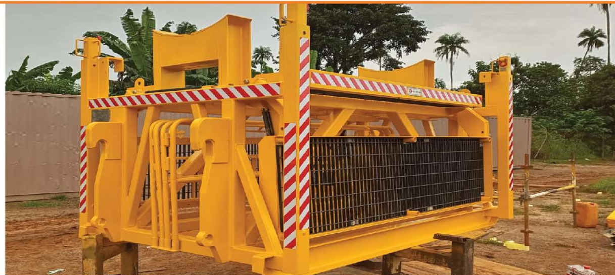
UNDERGROUND FAN INSTALLATION BASKET