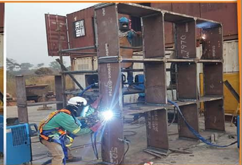
CRUSHER GRIZZLY PANEL (CONT'D)