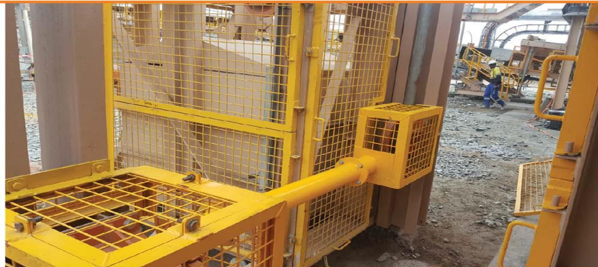
SUG CRUSHER INSTALLATION WORKS (CONT'D)