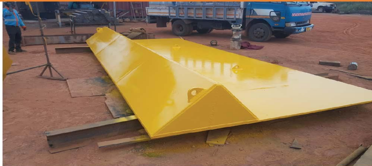
STOP BLOCK (CONT'D)