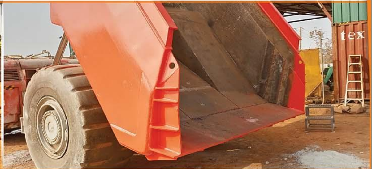
UNDERGROUND TRUCK TRAY AND DUCK TAIL EXTENSION