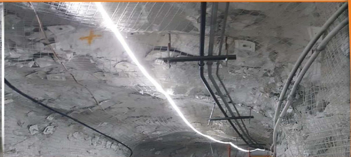
UNDERGROUND FUEL AND SERVICE BAY PIPE LINE CONSTRUCTION (CONT'D)