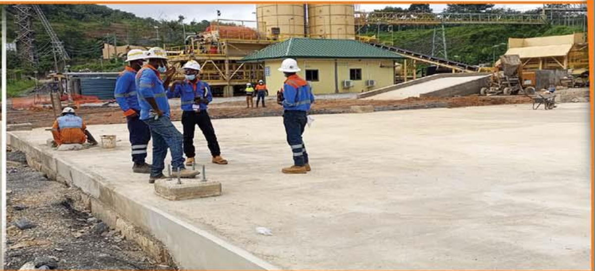
PASTE FILL STRUCTURE CIVIL WORKS (CONT'D)