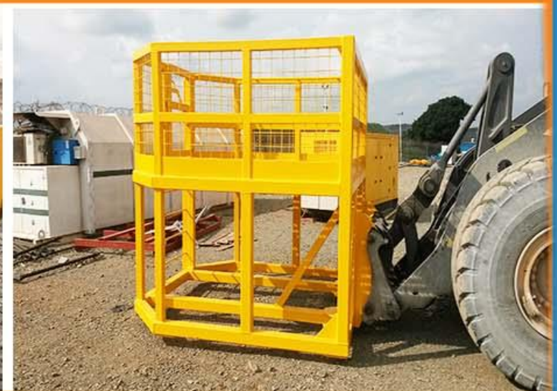
FABRICATION OF WORK AND CHARGE BASKETS