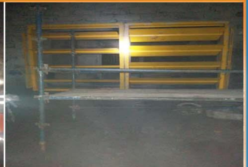
FABRICATION AND INSTALLATION OF LOUVER DAMPERS