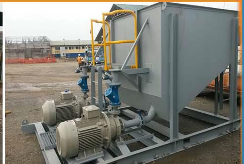
FABRICATION AND INSTALLATION OF STALKER TANKS (CONT'D)