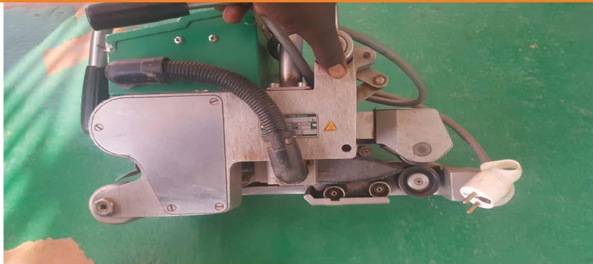
POLY LINER WORKS (CONT'D)