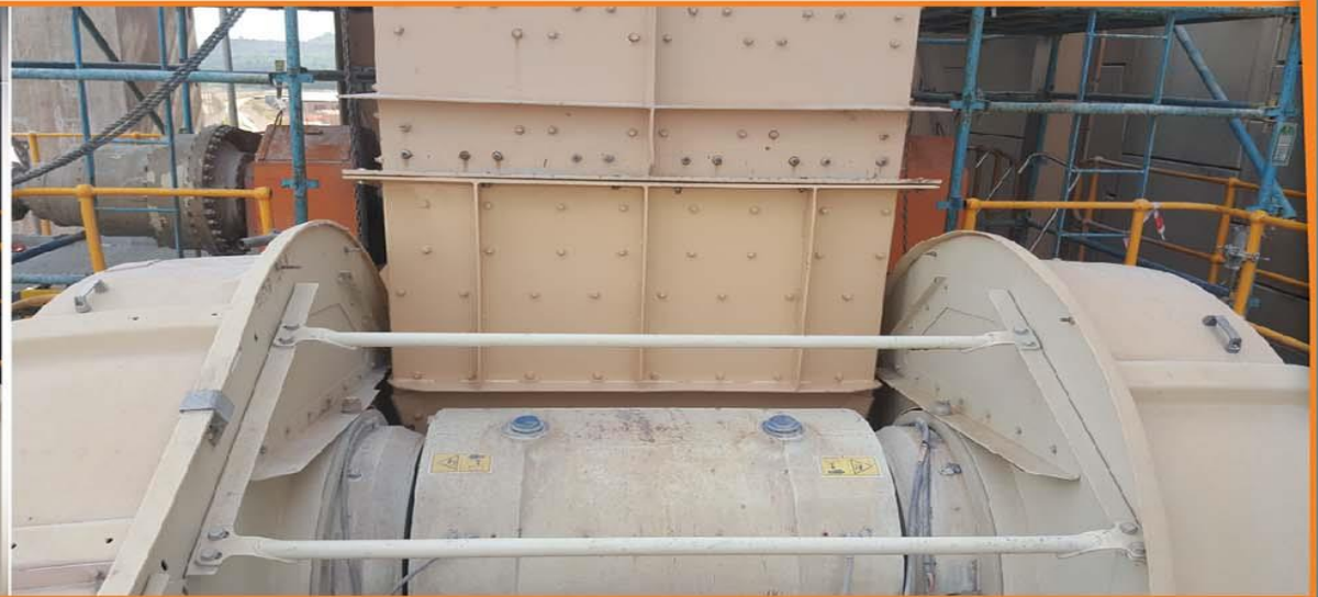
CRUSHER HEAD CHUTE FABRICATION (CONT'D)