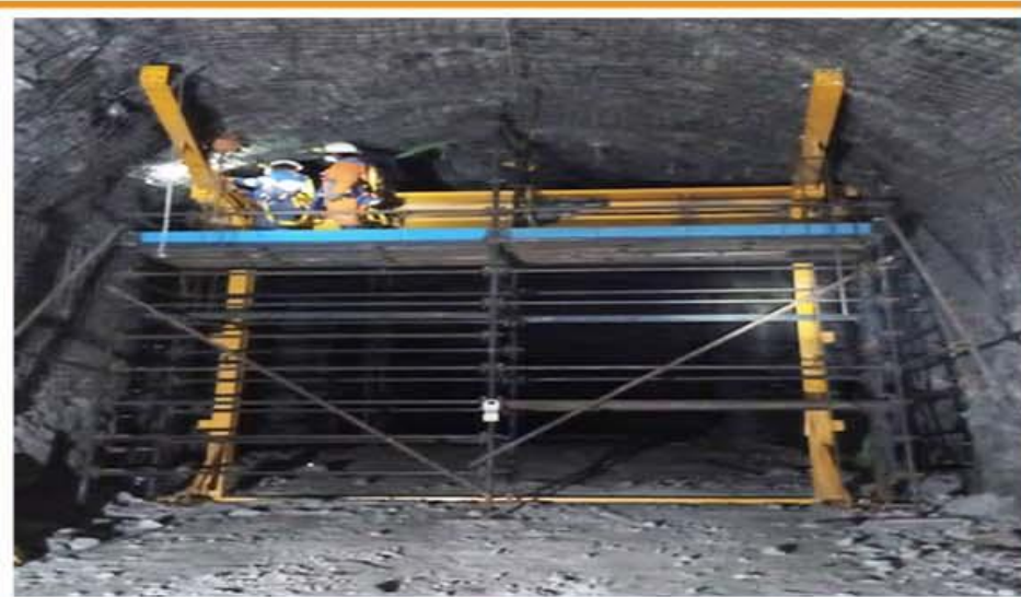
INSTALLATION OF TRUCK DOOR