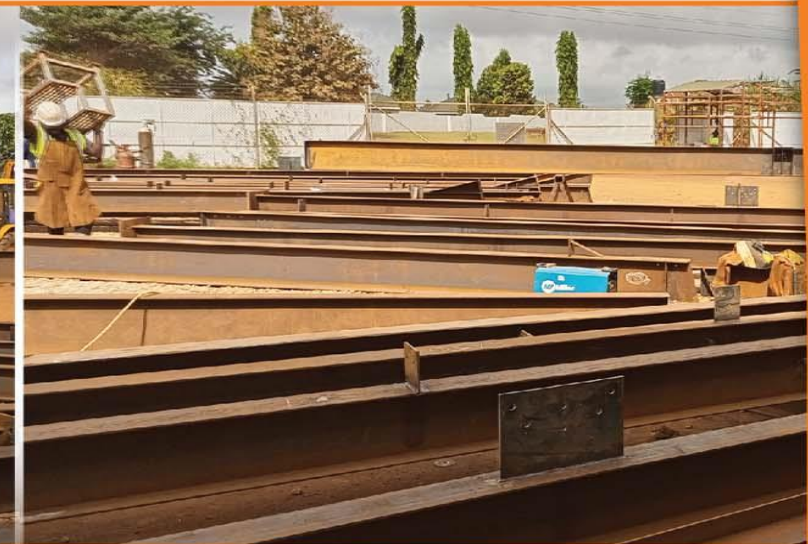
PASTE FILL STRUCTURE FABRICATION