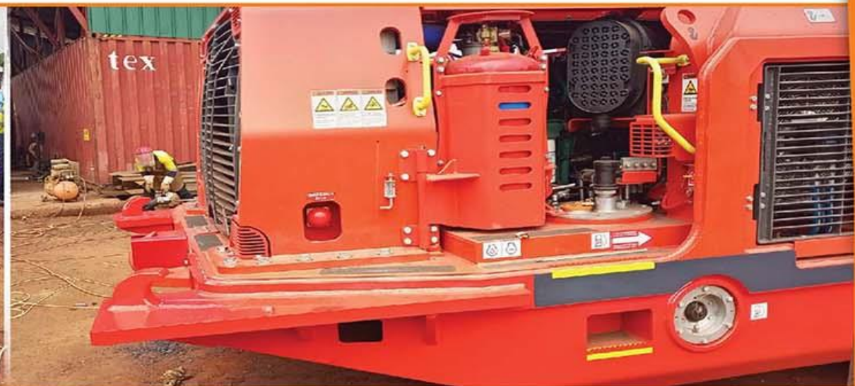
UNDERGROUND LOADER WINGS WITH TOW HOOKS (CONT'D)