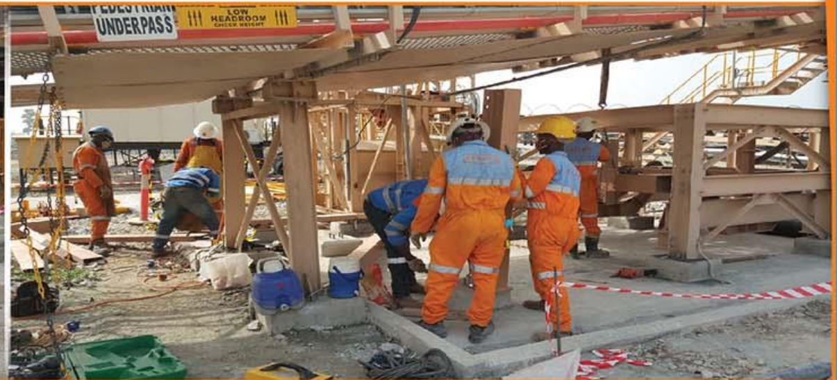
SUG CRUSHER INSTALLATION WORKS