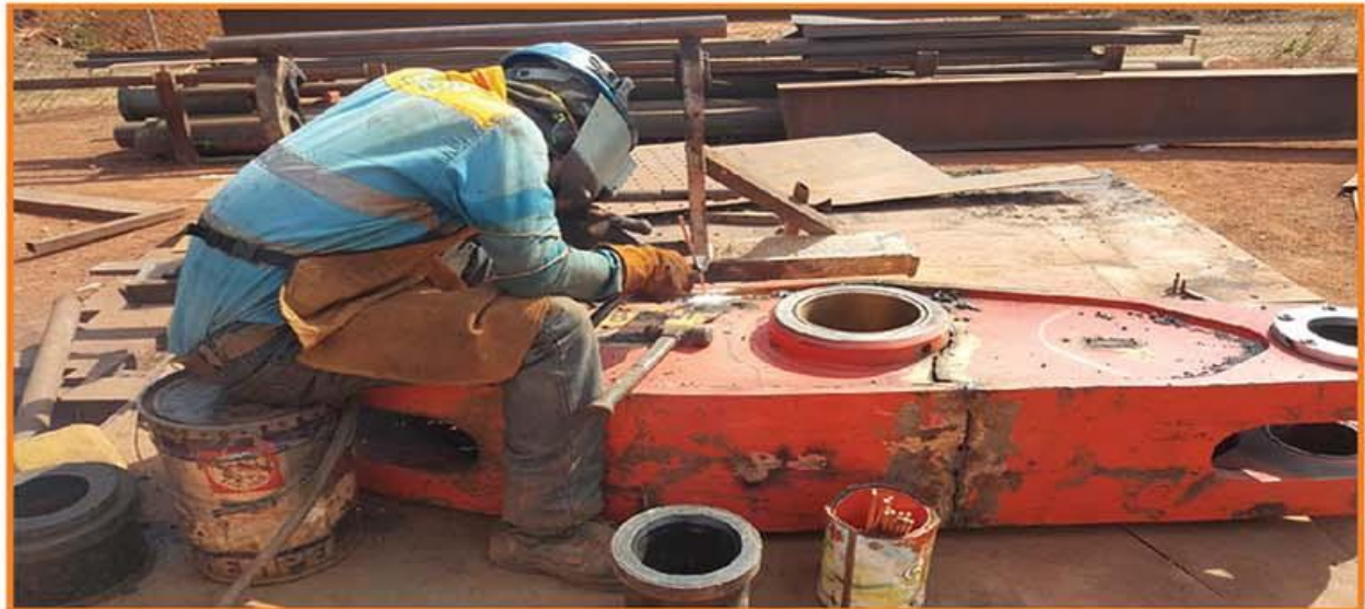
WELDING REPAIR WORKS ON JUMBO TILT LINK