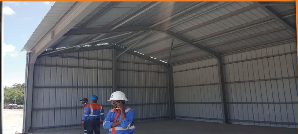
PASTEFIL STRUCTURE STEEL TAB (CONT'D)