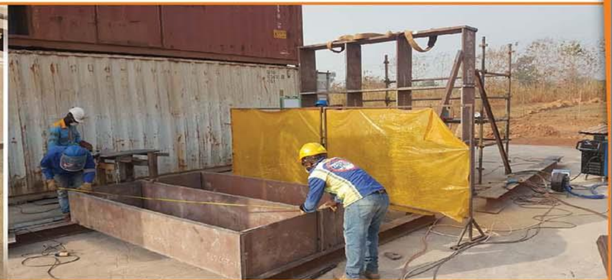
CRUSHER GRIZZLY PANEL