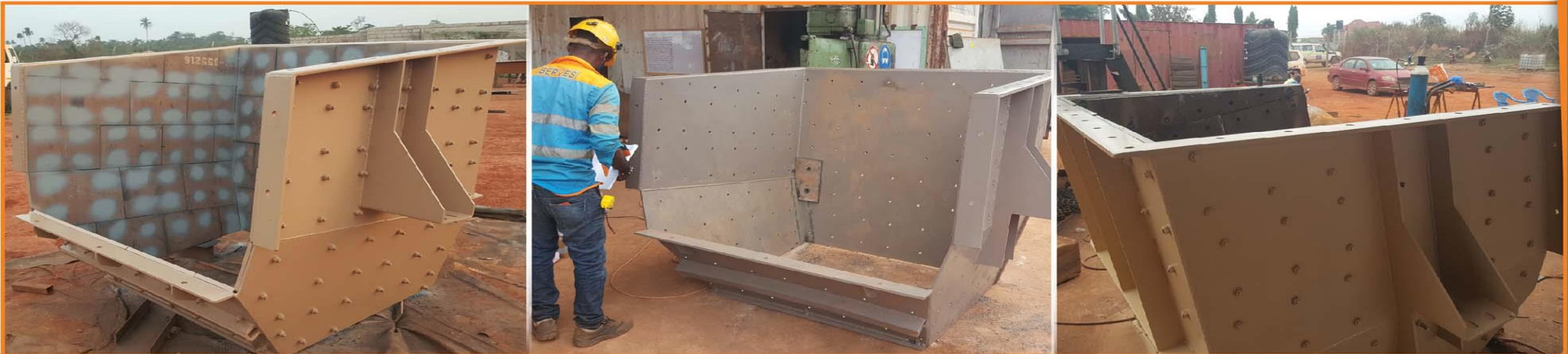
CRUSHER HEAD CHUTE FABRICATION