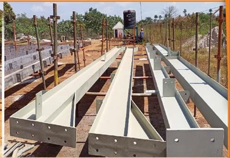
PASTE FILL STRUCTURE FABRICATION (CONT'D)