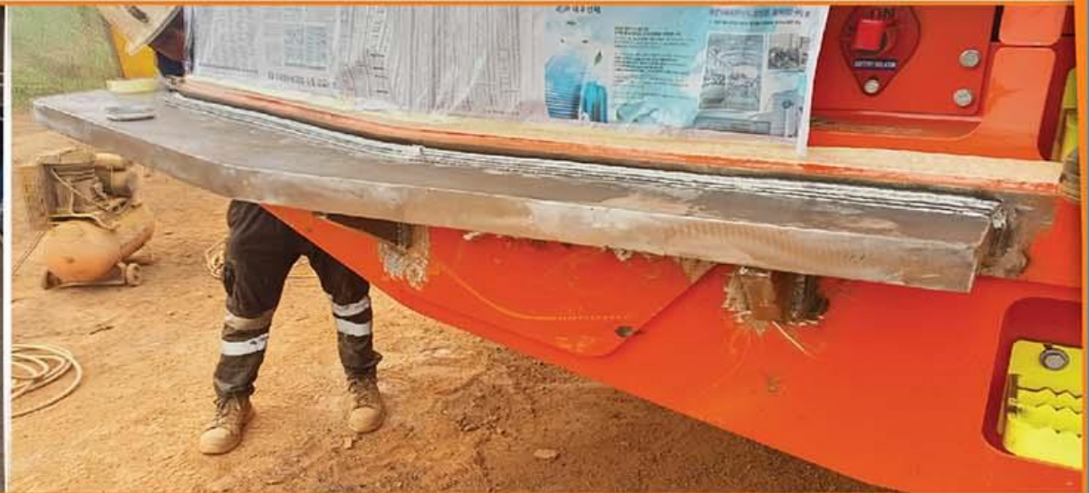
UNDERGROUND LOADER WINGS WITH TOW HOOKS