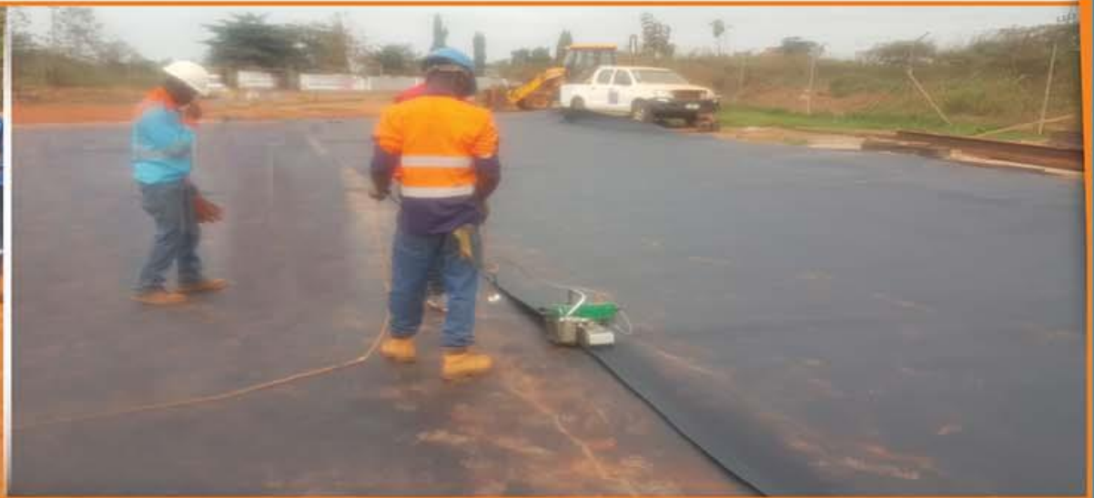
POLY LINER WORKS