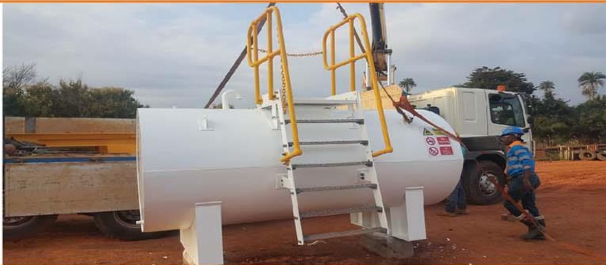
FUEL TANK (CONT'D)