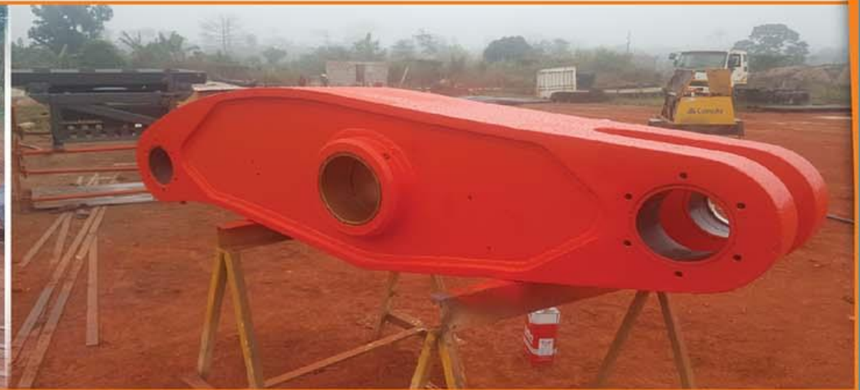
WELDING REPAIR WORKS ON JUMBO TILT LINK (CONT'D)